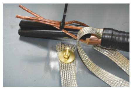
10. Repeat as needed on the motor end

www.sabcable.com 866-722-2974 • info@sabcable.com