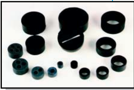
Multihole and flat cable seals.